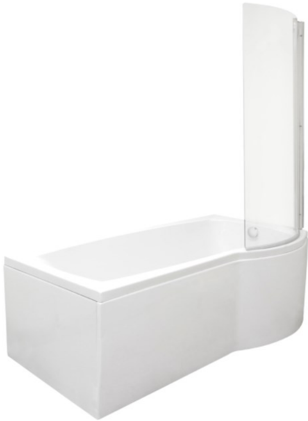
En-suite - walk in shower (picture for illustration purposes only)