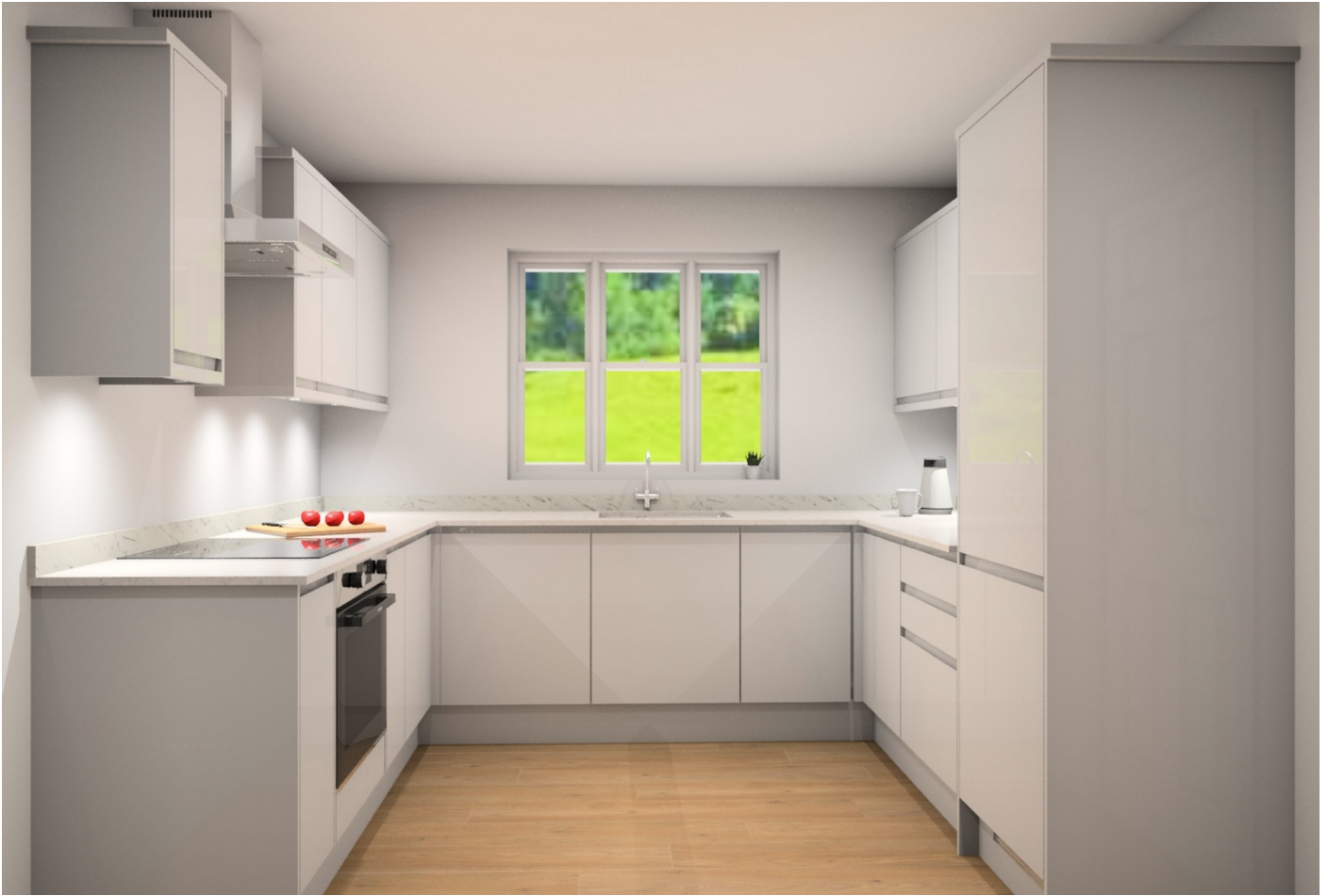
Kitchen worktop (picture for illustration purposes only)